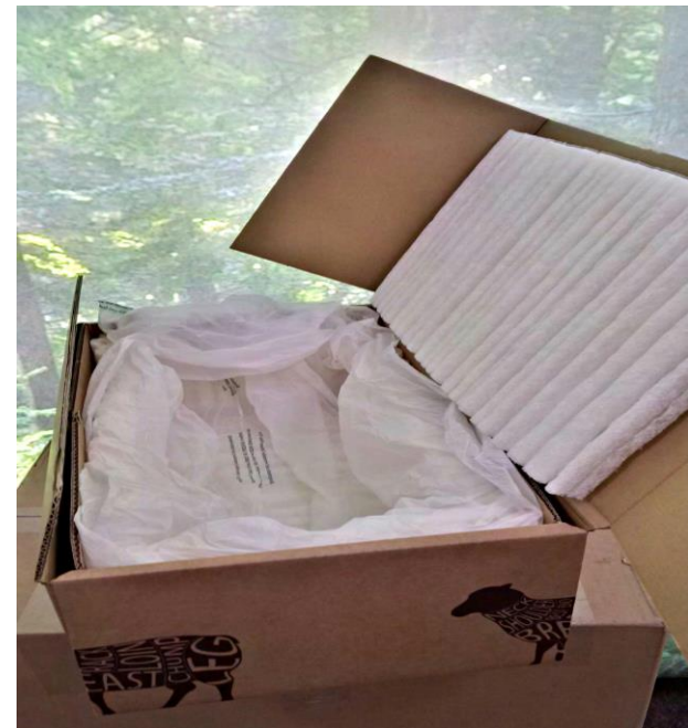
Cool Box Shipper