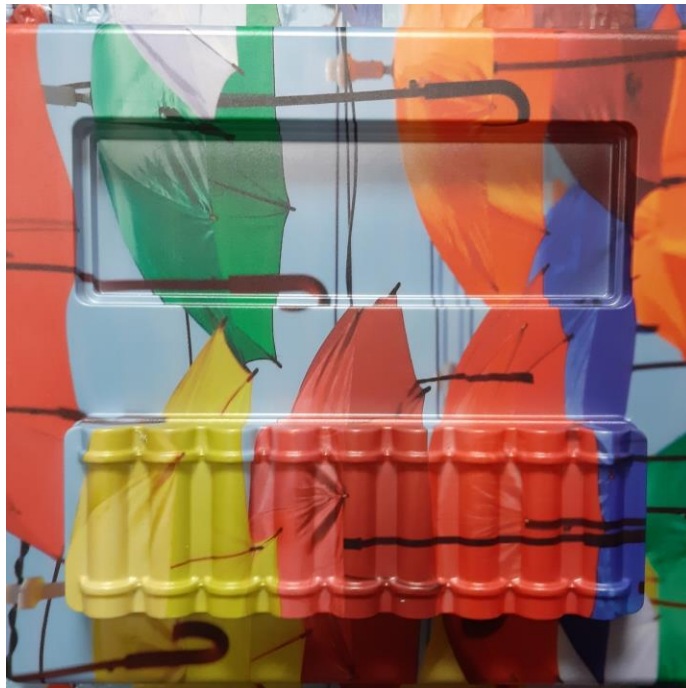
Thermoformed Reverse Printed & 100% Compostable