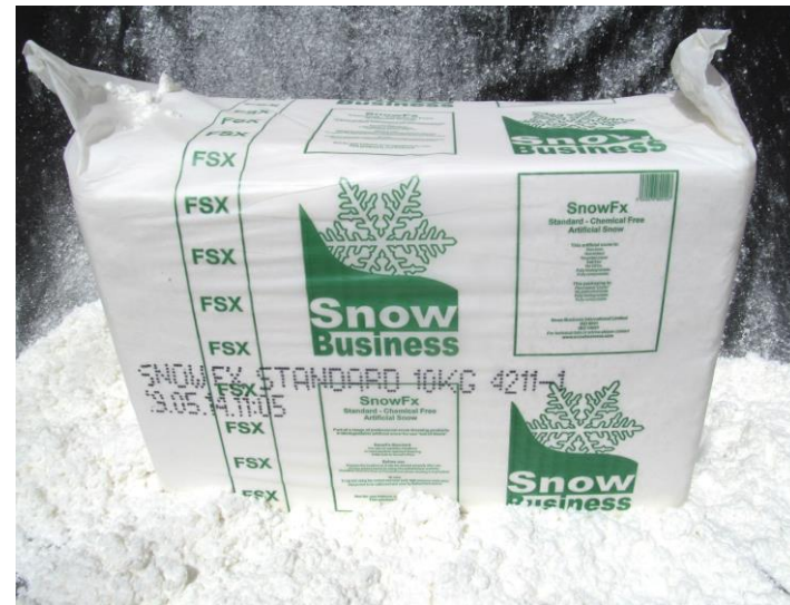
Global Brand Leader Snow Affects Using Biocompostable CompostaFilm